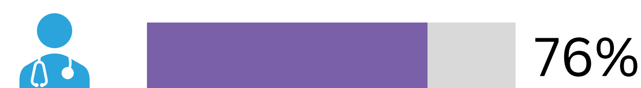
See a movement disorder specialist

While cost of medications was not the greatest concern of respondents, barriers do exist in accessing clinical care, understanding drug coverage, and overall healthcare cost burdens. Further assessment is warranted.