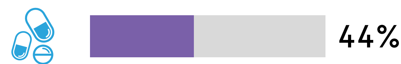
Take three or more medications for Parkinson's